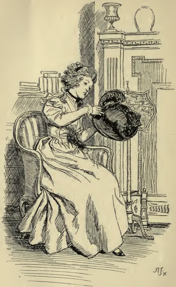
'She put in the feather last night.'